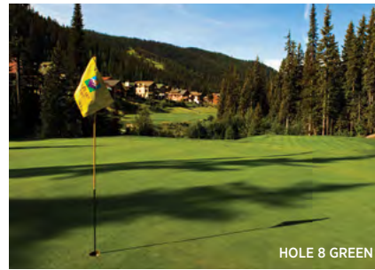
HOLE 8 GREEN