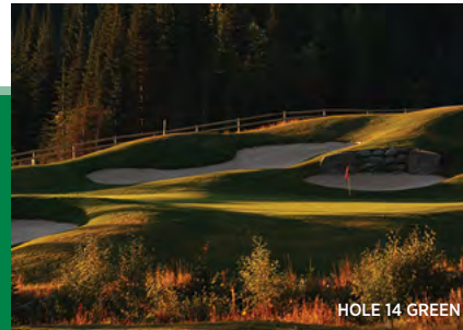
HOLE 14 GREEN