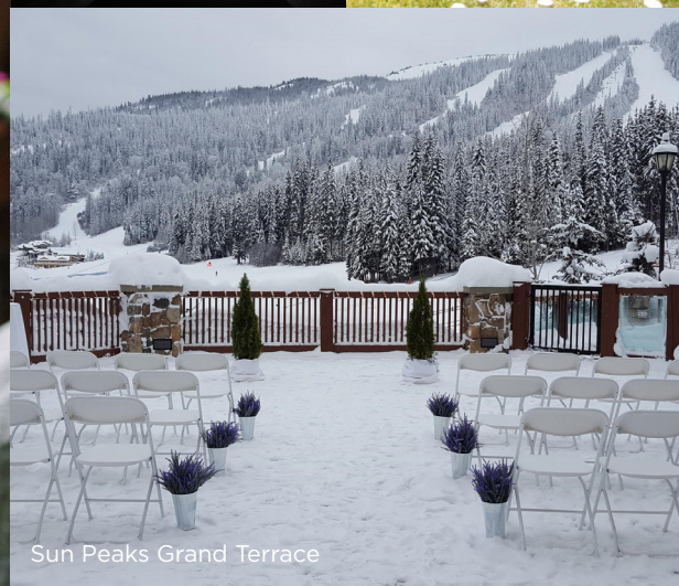
Sun Peaks Grand Terrace