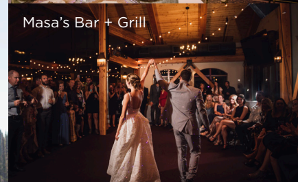
Masa's Bar + Grill