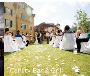
Cahilty Bar & Grill