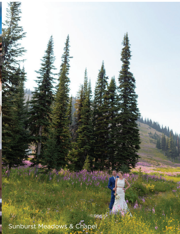
Sunburst Meadows & Chapel