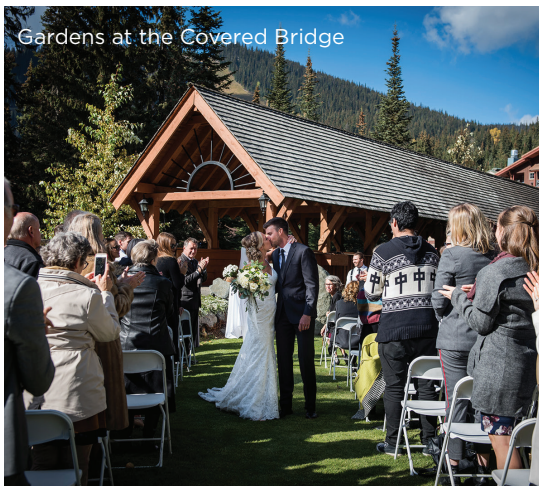
Gardens at the Covered Bridge