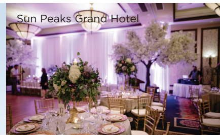
Sun Peaks Grand Hotel