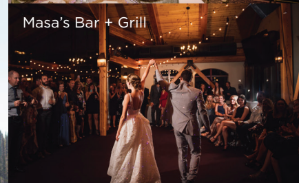
Masa's Bar + Grill